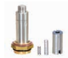
Valve service kit