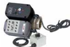
2" AIR-SAVER with remote switch