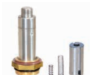
Valve service kit