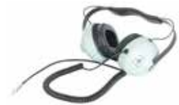
Deluxe hard-Hat headset for LOCATOR