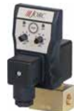
FLUIDRAIN 40 bar

For applications up to 80 bar - brass valve