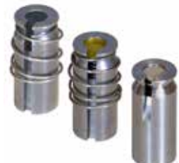
Various seal options