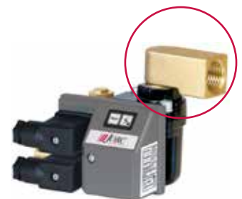
KAPTIV-MD-AL equipped with side inlet adapter