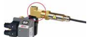
KAPTIV-MD-AL equipped with DRAIN HEATER 'T' adapter and DRAIN HEATER