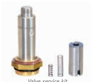
Valve service kit

See page 14 for additional timer drain service parts