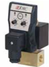
FLUIDRAIN 80 bar