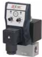
80 bar stainless steel FLUIDRAIN

For applications up to 250 bar - stainless steel valve