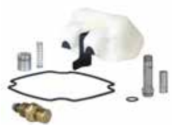
Service kit for NUFORS-CR