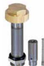
Valve service kit