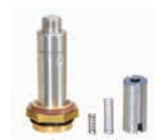
Valve service kit

See page 14 for additional timer drain service parts