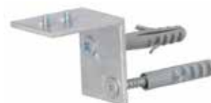
Wall mounting bracket