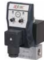
250 bar stainless steel FLUIDRAIN

For applications up to 350 bar - stainless steel valve