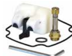
Service kit for MAGY drains