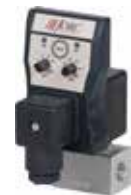
40 bar stainless steel FLUIDRAIN

For applications up to 80 bar - stainless steel valve