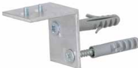
Wall mounting bracket