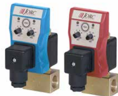
Private labelling options and various colors available