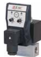
400 bar stainless steel FLUIDRAIN

For low voltage versions - Please contact us