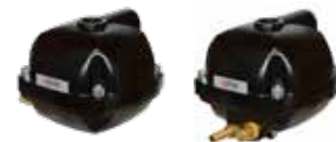
MAGY with or without test button

See how it works: https://www.jorc.eu/en/products/level-sensed-drains/magy/movie