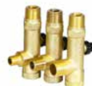
Ball valve strainers