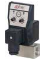
Stainless steel FLUIDRAIN

For applications up to 40 bar - stainless steel valve