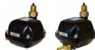
MAGY-UL including anti-airlock adapter, with or without test button

See how it works: https://www.jorc.eu/en/products/level-sensed-drains/magy-ul/movie