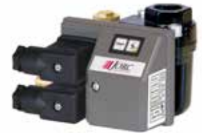
KAPTIV-MD-AL with alarm feature

See how it works: https://www.jorc.eu/en/products/level-sensed-drains/kaptiv-md-al/movie